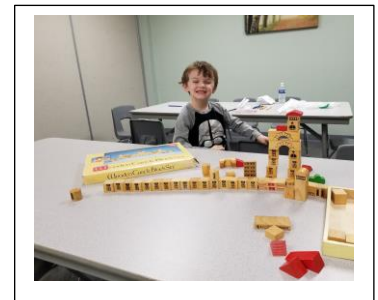
Kids enjoys a day of fun at the annual Kids Club Valentine's party.