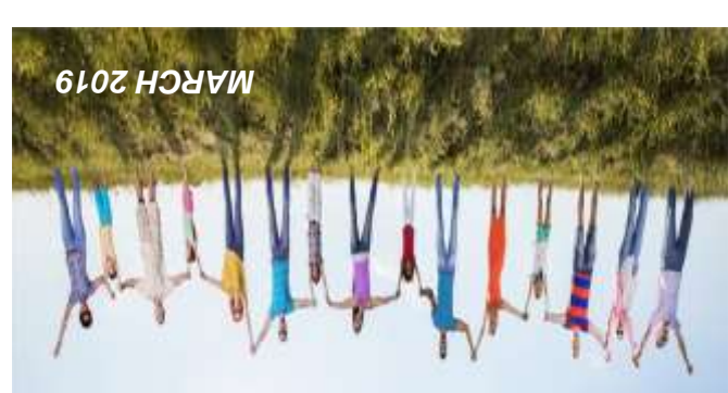
A monthly newsletter from the Hickory Hills Presbyterian Church